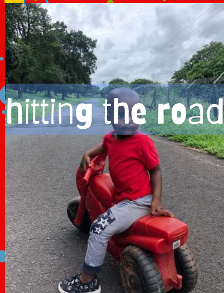
hitting the road