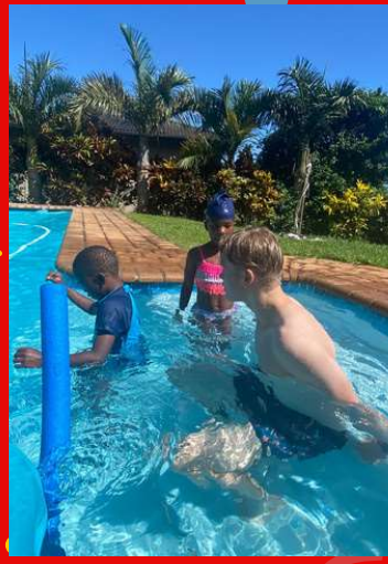
sugar rush park