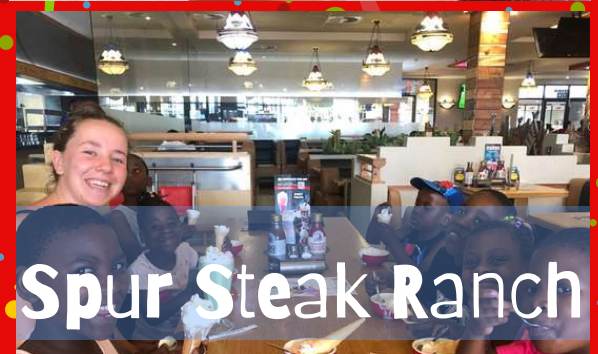
Spur Steak Ranch